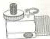
HF201001AV AIR MANIFOLD