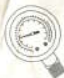
GA230660AV AIR GAUGE 0 TO 140 psi

Address parts correspondence to: The Campbell Group Attn: Parts Department 180 Production Drive Harrison, OH 45030 U.S.A.