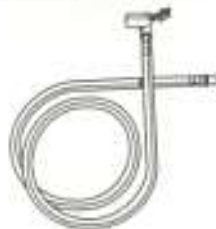
SV85301AV 3 FT. AIR HOSE WITH TIRE UNIVERSAL ADAPTER